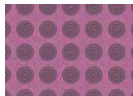
PC-7976-P ½ yd