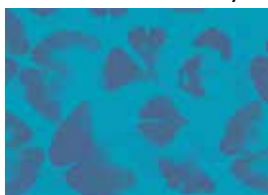
PC-7975-B ½ yd