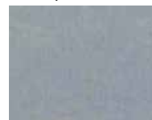
A-C-Tailor ¾ yd