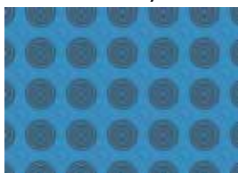
PC-7976-B Fat ¼ yd