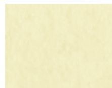
A-C-Linen 1¼ yds (backng)