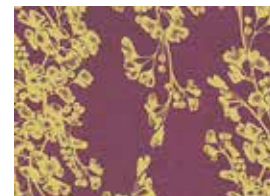
PC-7974-MR ½ yd