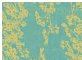
PC-7974-MG ½ yd