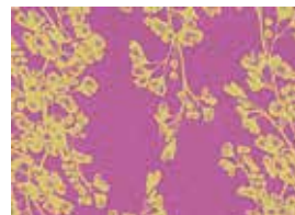
PC-7974-MP Fat ¼ yd