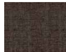
A-C-Ebony ¾ yd