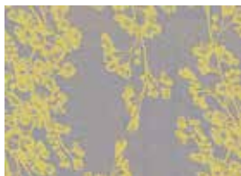
PC-7974-MB Fat ¼ yd