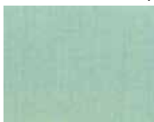
A-C-Bluegrass ¾ yd